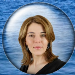
Pr Silvia Ortega Gutiérrez Chemical Probe