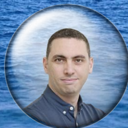
Pr Mehdi Bennidir Natural products